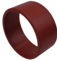
4" SCH 40 to 110mm Pipe Adapter PART #: 30142-EUR