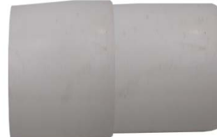
4" SCH 40 Socket