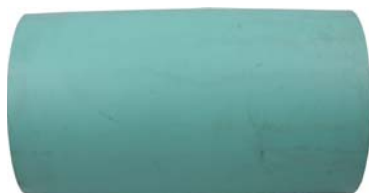
4" SDR 35 Pipe