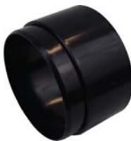
4" SDR 35 to 4" SDR 35 Adapter PART #: 30142-68X