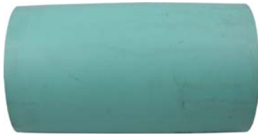
4" SDR 35 Pipe