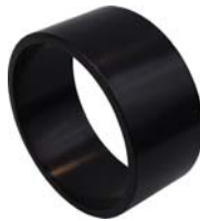
4" SCH 40 to 4" SDR 35 Adapter PART #: 30142-R